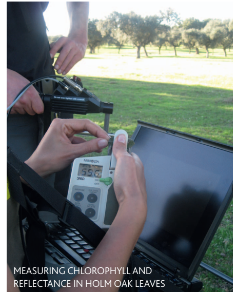
MEASURING CHLOROPHYLL AND REFLECTANCE IN HOLM OAK LEAVES

Recent technological advances have been used by the Biospec project group, as team member